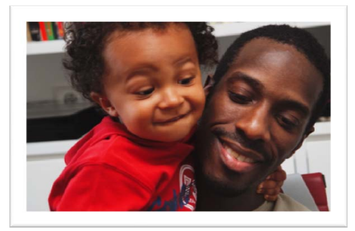
Domain 3: Social and Emotional Development

Social and Emotional Development: Foundational Skills