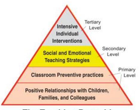
The Teaching Pyramid

dimensions: the ability to control one's impulses (not grabbing a coveted toy from a peer's hands) and the capacity to do something because it's needed (asking to play with the desired toy and then waiting one's turn). According to Bodrova and Leong, self-regulation is used in both social interactions and in thinking, providing the researchbased example of having to overcome the desire to focus on the picture of a dog when reading its caption of "cat." Children's selfregulation behaviors in the early years are regarded by researchers as more predictive of school achievement in reading and math than their IQ scores. 39, 40